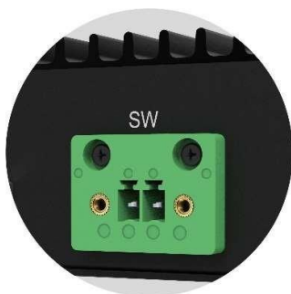
Remote PWR Switch

6pcs COM ports for more extended functions