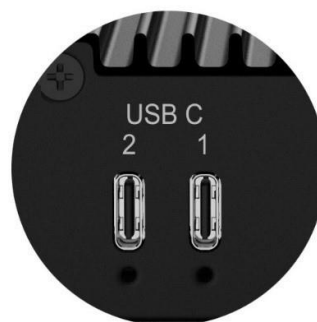
Two USB C DP Alternate Mode and PD